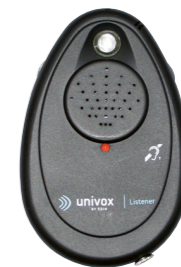
Univox® Listener Loop Receiver/Testing Device Part No 401010