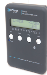
Univox® FSM 2.0 Field Strength Meter Part No 401040